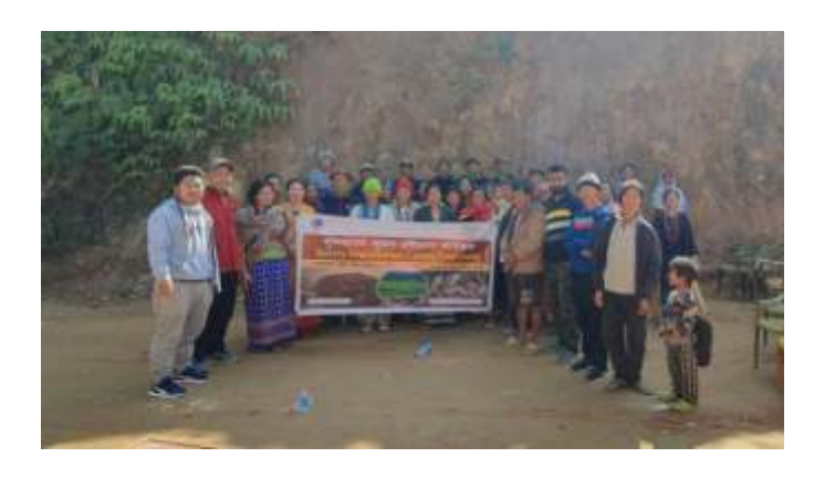
Participants after the quality improvement training programme on Large Cardamom

Spices Board Field Office, Ziro, Arunachal Pradesh conducted a growers training programme on Large Cardamom at Ambam village on 30 January 2023. A total of 54 members participated in the training programme.