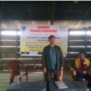
Glimpses of the growers' training programme on Large Cardamom.