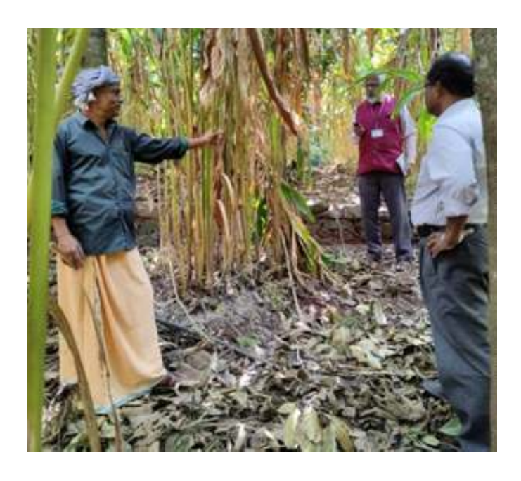
Farmer explaining the problems