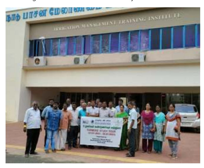
Farmers at Irrigation Management Training Institute as part of their visit

Spices Board Field Office, Bodinayakanur, Tamil Nadu organised a farmers' study tour programme during 23-25 January 2023 with an aim to train the farmers on latest technologies in the field of food processing, value addition, marketing and business opportunity with start-ups, to facilitate knowledge sharing, exchange of experiences, etc. Farmers visited the National Institute of Food Technology & Entrepreneurship Management (NIFTEM-T), Thanjavur; Tamil Nadu Irrigation Management Training Institute (IMTI); Trichy Agri Business Incubation Forum (TABIF); ICAR-Krishi Vigyaan Kendra; Gandhigram Deemed to be University (DTBU) and the elite spice plantations of Lower Palani Hills. All the farmers including FPOs gained knowledge on new technologies and benefitted from the study tour.