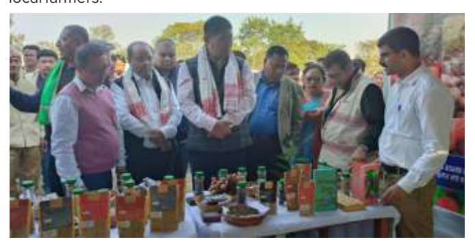
Dignitaries visiting Spices Board's pavilion put up at Atmanirbhar Dhemaji Agro Expo 2023 held at Dhemaji in Assam.

Spices Board Divisional Office, Itanagar, Arunachal Pradesh participated in Atmanirbhar Dhemaji Agro Expo 2023 held during 11-14 January 2023 at Dhemaji, Assam. In the event, officials from Spices Board elaborated on the activities of the Board in North Eastern states including Assam. The Board's exhibition stall was visited by Shri Pradan Baruah, Member of Parliament, Shri Bhuban Pegu, Member of Legislative Assembly from Assam besides visitors from different departments, FPC members and local farmers.