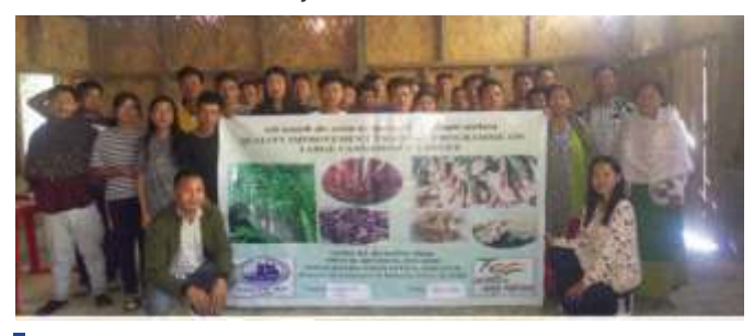
A glimpse of the growers' training programme on Large Cardamom and ginger

Spices Board Field Office, Dimapur, Nagaland organised growers' training programmes on Large Cardamom and Ginger at Heiranglwa, Peren district on 10 January 2023 and at Nkialwa, Peren district on 11 January 2023.